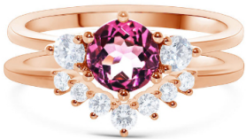
The double band Genny ring in 18k pink gold is set with a pink tourmaline surrounded by diamonds from the French jewelry house of Celinni.