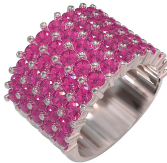
The Vendôme ring in 18k white gold with 2.5k of pink sapphires from the French jewelry house of Celinni.

Paris, France — It is a magnetic color, majestic, but is it purple or pink? Magenta remains one of the most eye-catching shades around. The Parisian jewelry house of Celinni, known for its excellent value diamonds, has brought out some stunning pieces revolving around magenta embodied by pink sapphires and pink tourmalines selected for their shades of magenta. The Vendôme ring in 18k white gold is studded with 2.5k of pink sapphires while the necklace Ma Vie also in 18k white gold has a pink sapphire centerpiece surrounded by diamonds. Meanwhile the double band Genny ring in 18k pink gold is set with a beautifully cut pink tourmaline surrounded by diamonds.