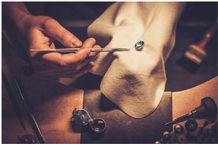
In the workshops of the French jewelry house of Celinni.

The house of Celinni is specialized in made-to-measure pieces and works with the finest craftsmen in Paris and France, working with precious metals, gemstones and of course diamonds. Maison Celinni Atelier-bijouterie, 9 rue Buffault, Paris 75009 (by appointment). www.cellini.com